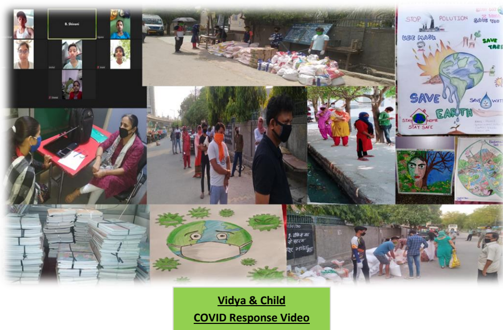
Vidya & Child COVID Response Video